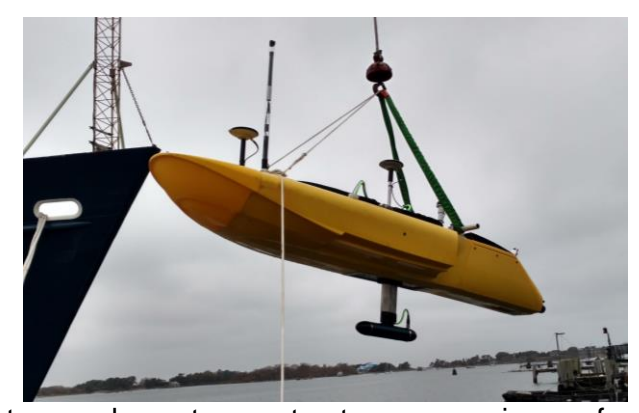
to complement current autonomous mine warfare systems and provide a level of visualisation and

New automated mine disposal systems are ensuring that the dangerous task of mine disposal can now be undertaken in relative safety. Ping DSP's new system is designed to work on a range of Automated Surface and Automated Underwater Vehicles. Compact in size with a low power requirement It is designed